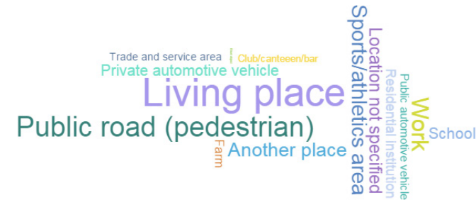
Fig. 2. Word-count distribution by the site of occurrence, i.e. the number of injuries at each location of occurrence determines the size of each possible site of occurrence.

in Finland provides with guidelines to prevent falls in these population. Through this program, a person who lives with older people receives instructions to transform a house into a smart home [30]. The United Kingdom and Spain also apply the idea of changing environments into smart environments since ten years ago. Notably, the concept of a smart kitchen has reduced the number of unintentional injuries at the living place in such countries [20]. Also, it is important in the European countries and the United States have a long tradition in the prevention of injuries at work. These governments have identified the high correlation between fatigue and work injuries, which has boosted awareness campaigns between workers and employers to determine the risk of injuries by fatigue [26].