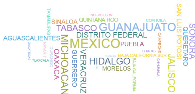
Fig. 1. Word-count distribution by Federal Entity, i.e. the size of each federal entity is a function of the number of injury lesions registered as hospital admission at each federal entity.

Also, Michoacán, Tabasco and Veracruz stand out from Figure 1, which is natural due to the presence of