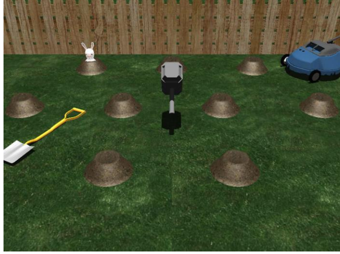
Fig. 3 Virtual task screenshot

The physic and visual elements used to develop the virtual task are explained in the following subsections.