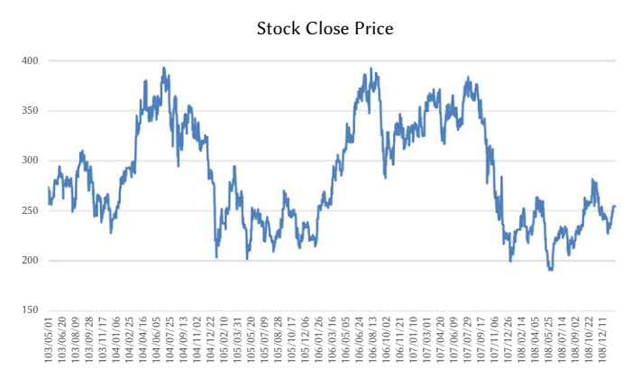
Fig. 2. The closing price of the stock used in the experiments.

As for the stock price series, according to the time interval of the news, the time interval of our stock acquisition extends from May 1, 2014 to January 30, 2020, and the data was collected from the Taiwan Stock Exchange. The closing price of the stock used in this study is shown in Fig. 2.